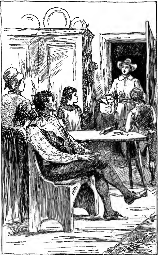
The family were gathered in the kitchen.—See page 18.